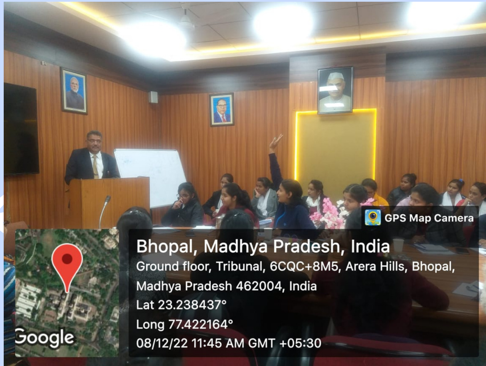
The lecture on Constitution of India.