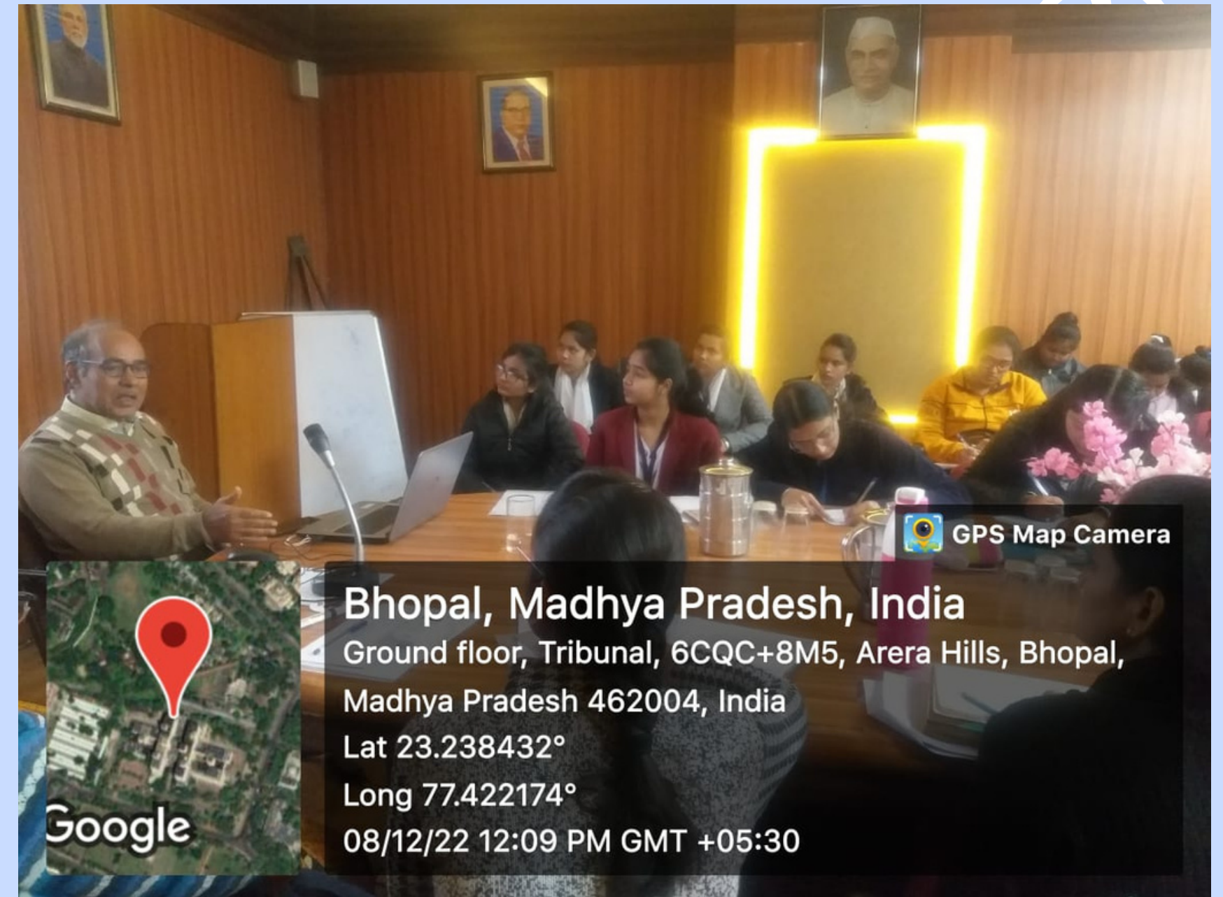
The lecture on The Budget.