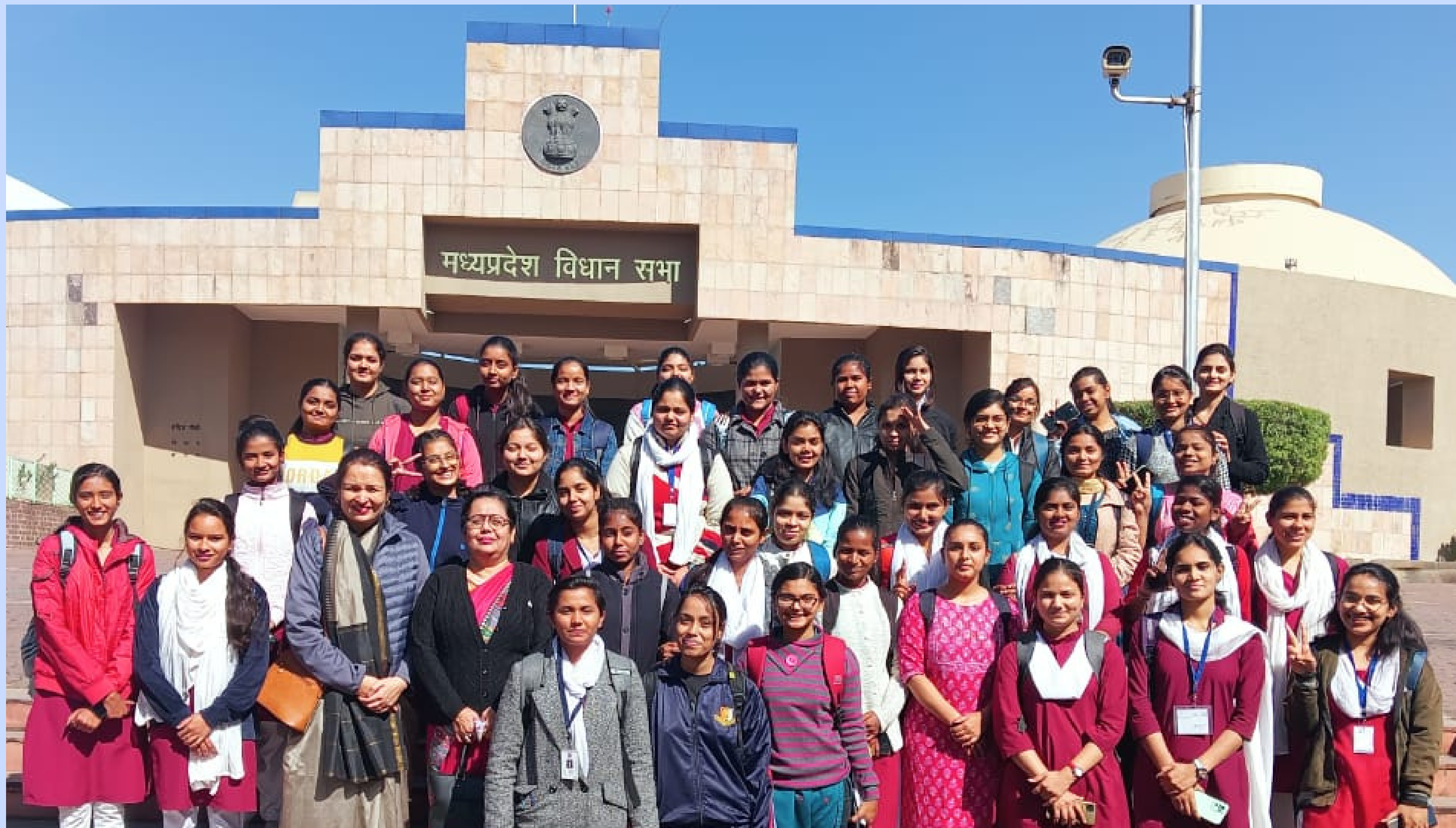
Visit to Madhya Pradesh Vidhan Sabha.